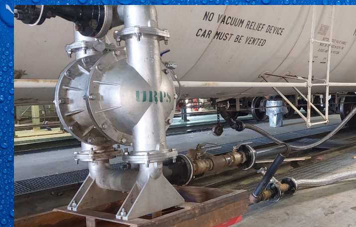
Pump to offload effluent for filtration process