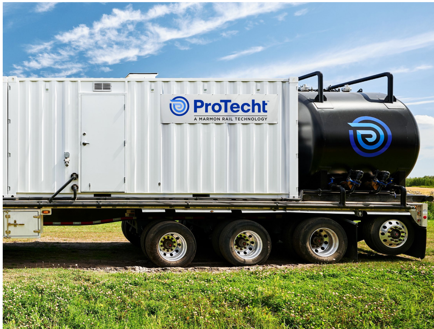
Insulated container houses the filtration unit