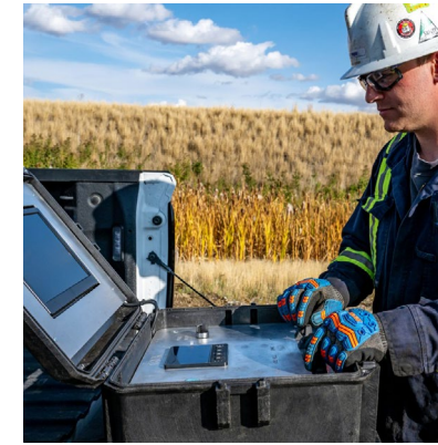
Automated cannon is controlled remotely from the ground

The result? Faster cleaning cycles, lower environmental impact, and tank cars returned to service quicker than with conventional tank car cleaning methods.