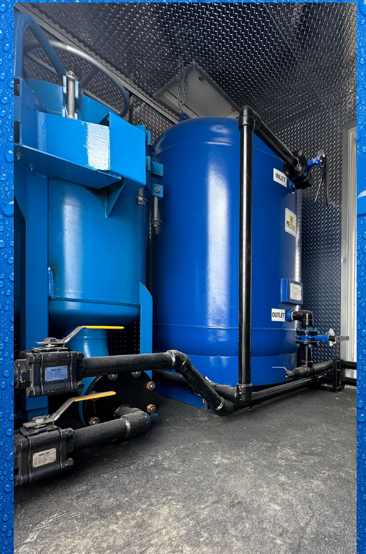
Three part water filtration system and holding tanks for tank car cleaning