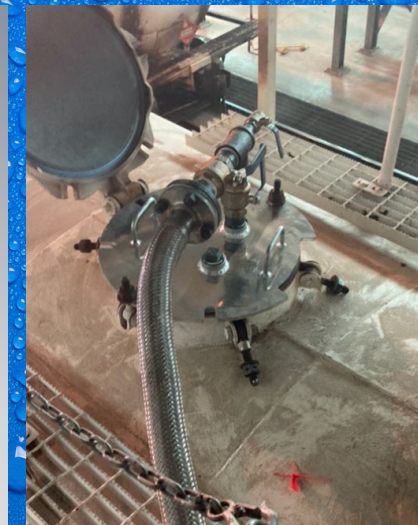
3D Rotary Orbital Sprayer – Fastened in the manway, the sprayer rotates a full 360 degrees and sprays down the tank car in 20 minutes