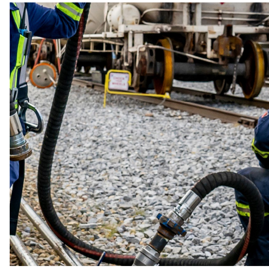
Cleaning hose hook-up process